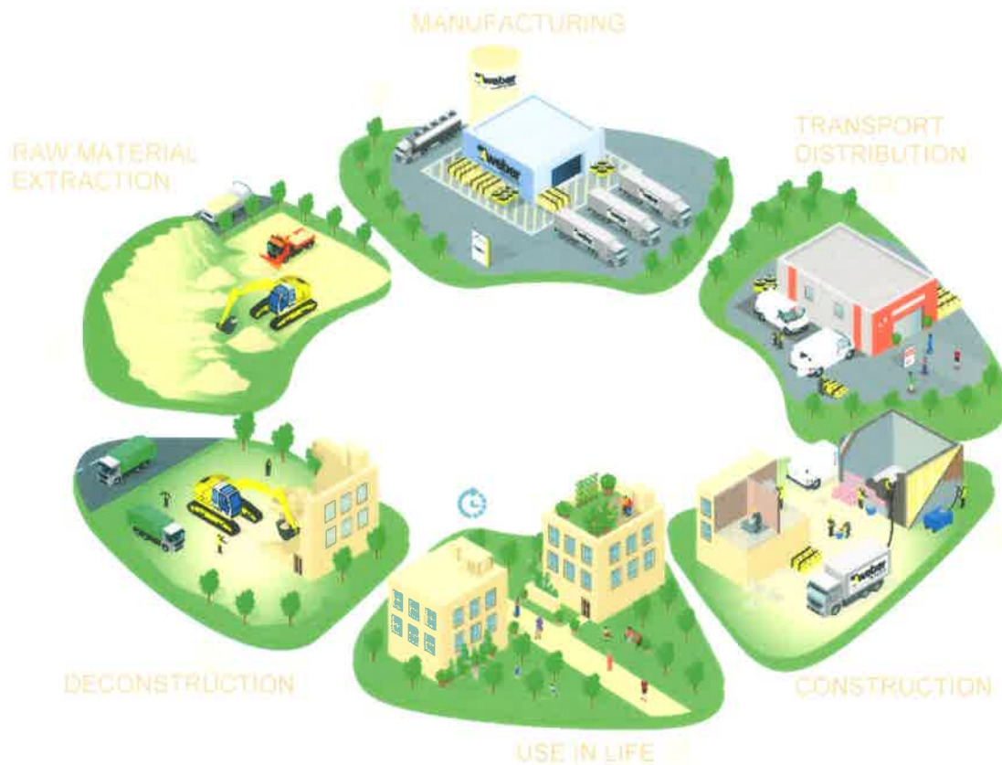
Figure 1: Life Cycle illustration of a product for construction